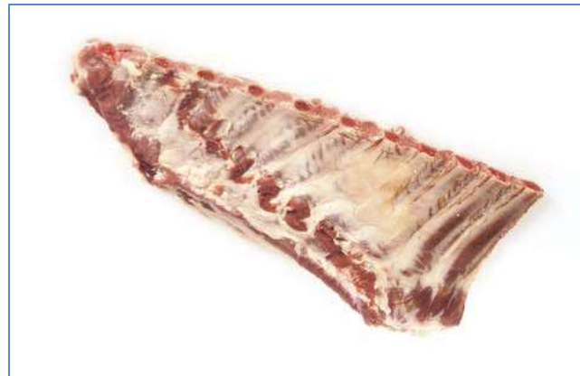
5 Spare Rib – belly.