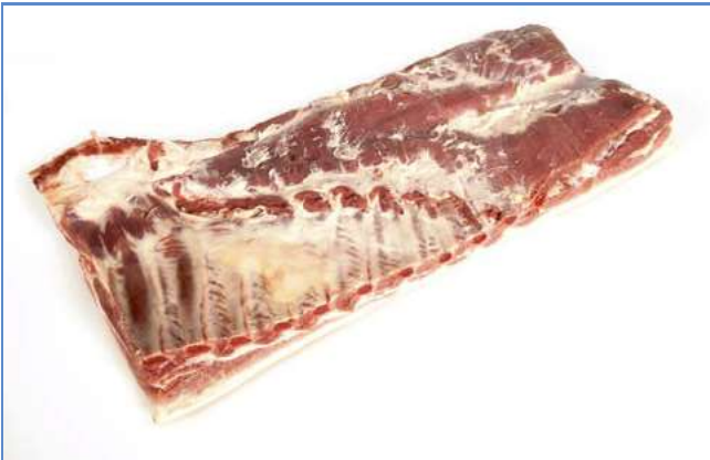
1 Rindless belly of pork.