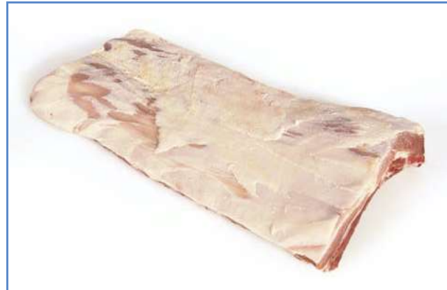
2 Rindless belly of pork.